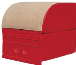
Table Top Blocks